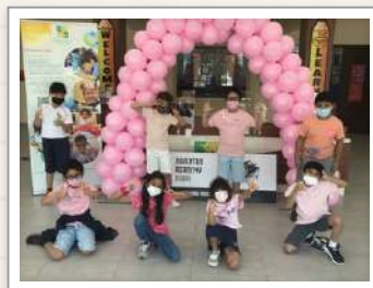
Looking Perfect for Pink Out Day!