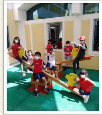
SUPER STARS wearing RED for Dyslexia Awareness!